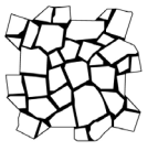
LARGE RANDOM TILE (450 x 450mm)