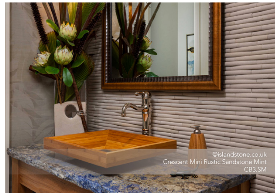
Crescent Mini Rustic Sandstone Mint CB3.SM