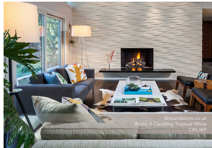
Rustic II Cladding Tropical White CR5.WP