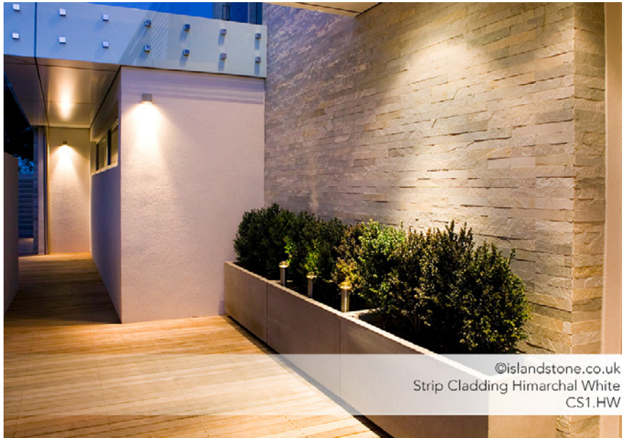
Strip Cladding Himarchal White CS1.HW