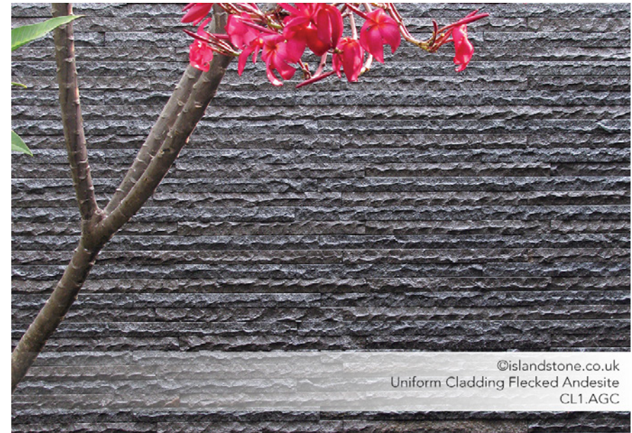
Uniform Cladding Flecked Andesite CL1.AGC