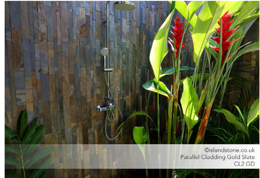
Parallel Cladding Gold Slate CL2.GD