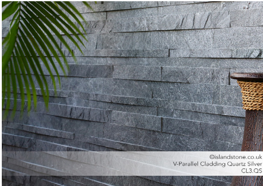
V-Parallel Cladding Quartz Silver CL3.QS