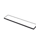
STRIP CLADDING (48 x 300mm)