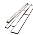
V-PARALLEL CLADDING (163 x 580mm)