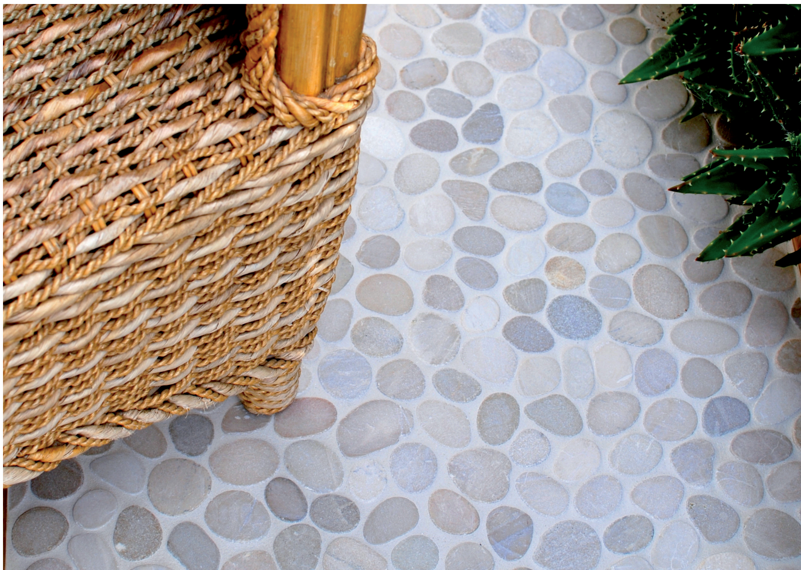
Flat Pebble French Tan FP1.PF