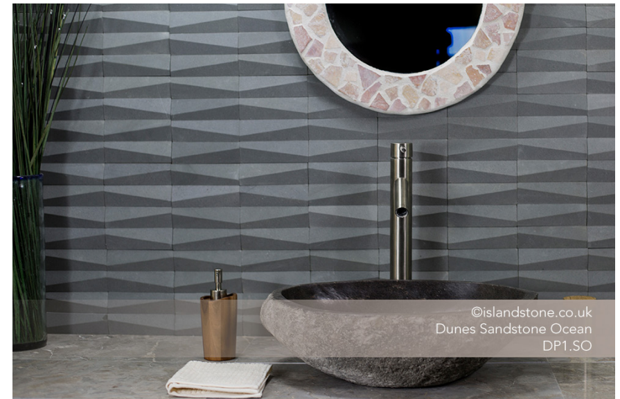
Dunes Sandstone Ocean DP1.SO