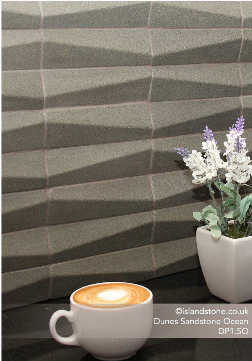
Dunes Sandstone Ocean DP1.SO