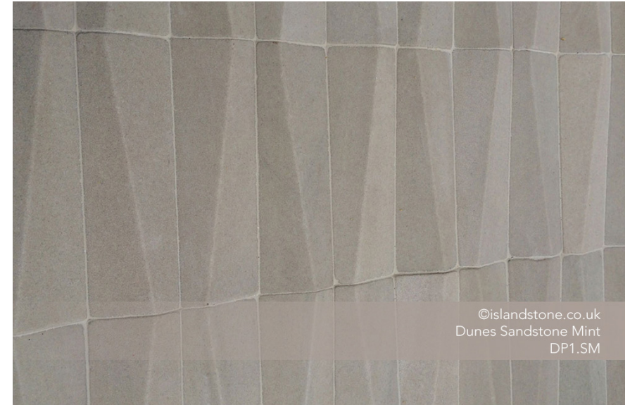
Dunes Sandstone Mint DP1.SM